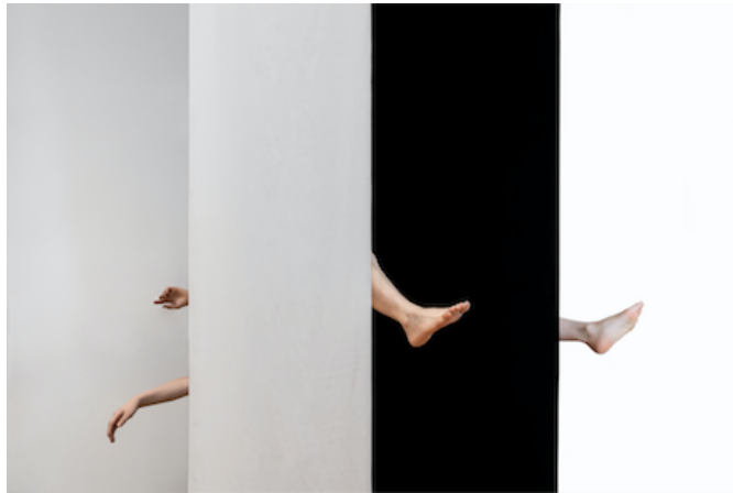
Pianist , 2018, Archival pigment print, 53x35 inches

DOOSAN Gallery New York 533 W 25th Street, New York, NY 10001